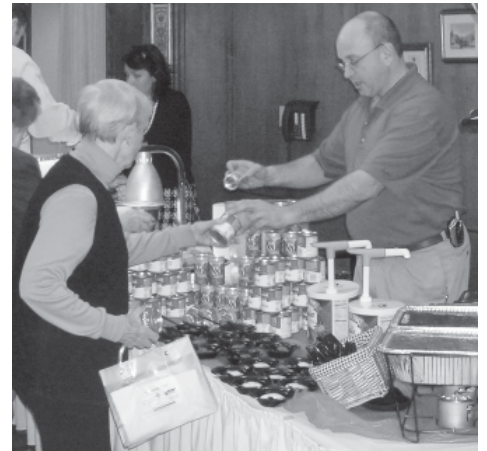
The Sysco Representative hands out samples of soup.

arranged by Glacier Hills food supplier, Sysco, was the most extensive to date. Attendees had the opportunity to sample healthy recipes ranging from fresh fruit to baked salmon. As one nibbler put it, “the treats are excellent!”